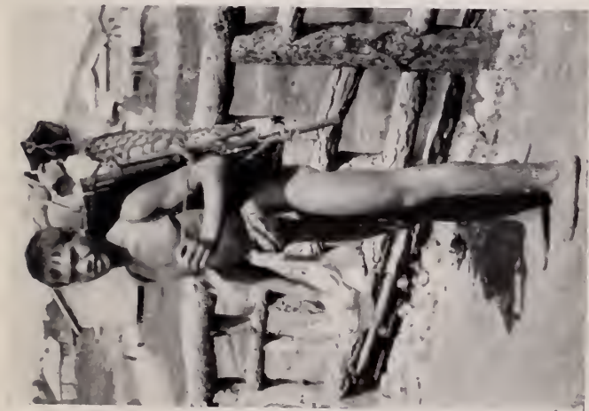
A native Filipino porter